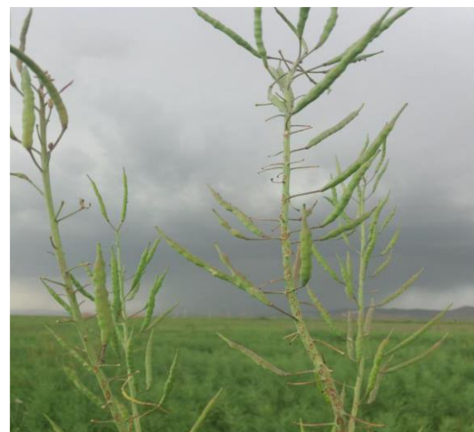
Figure 9. Flower drop and incomplete pod formation in parts of the stem due to spring frost during the flowering stage of oilseed rape.

Frost during flowering can also lead to flower abortion, which results in irregular and spaced-out pod formation. The abortion of oilseed rape flowers due to cold ultimately leads to incomplete pod formation on certain parts of the oilseed rape stem, and podding occurs irregularly (Fig. 9) due to the time gap between the developed pods and flowers produced after the frost event. The flowering period of oilseed rape is 30–40 days, and this gap allows oilseed rape to continue pod formation after frost events. Open flowers are highly sensitive to frost damage, while unopened pods and buds may escape freezing damage (Kovaleski et al., 2019).