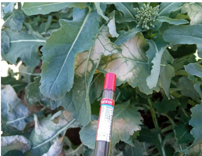
Figure 3. Leaf bleaching in oilseed rape due to severe cold.

The molecular mechanism behind the development of purple leaves in winter rapeseed ( B. napus ) during the rosette stage under cold stress involves complex biochemical and genetic pathways. Cold temperatures induce the accumulation of anthocyanins, which are pigments responsible for the purple coloration in plant tissues. Some key molecular mechanisms are the upregulation of anthocyanin biosynthesis genes, activation of transcription factors, and feedback regulation by repressor proteins (Zhou et al., 2015; He et al., 2020; Zhang et al., 2020). Thus, the color change in oilseed rape fields during winter is not a sign of frost damage, yield loss, or nutrient deficiency. As temperatures gradually rise, this color change disappears. However, severe cold during the rosette stage in winter oilseed rape or during leaf expansion in spring oilseed rape can lead to leaf wilting or bleaching (Fig. 3).