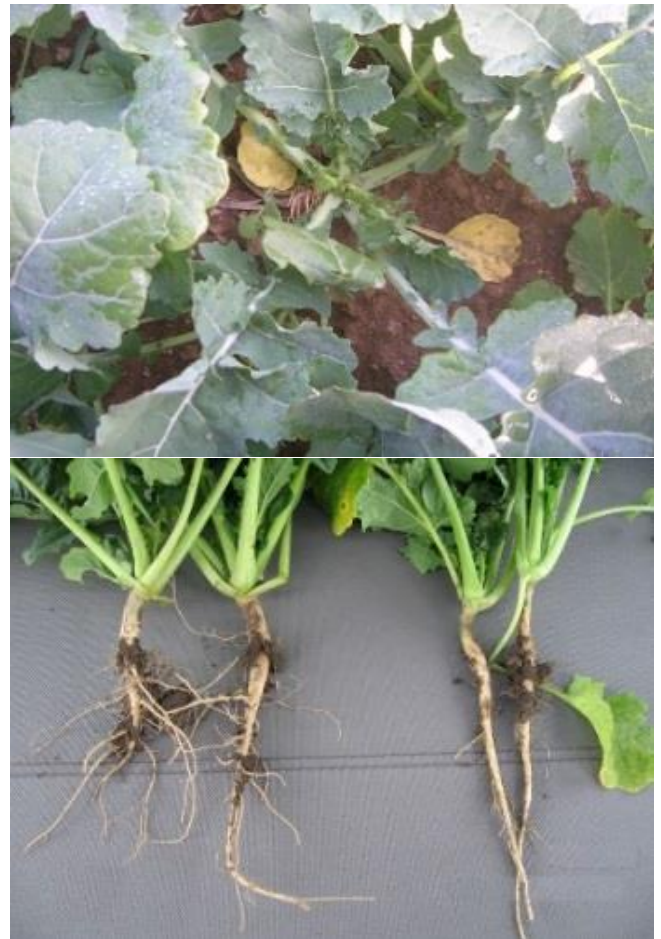
Figure 4. An oilseed rape plant at the complete rosette stage with well-developed shoots and roots.

maximum resistance to subzero temperatures, a fully hardened oilseed rape plant at the complete rosette stage should have 6–8 true leaves, a crown diameter of 10–12 mm, a root length of 30–35 cm, and a shoot apex positioned no more than 20 mm above the soil surface (Fig. 4). Late-emerging oilseed rape plants with poor shoot growth and weak root systems are most vulnerable to winter damage (De Meyer et al., 2023).