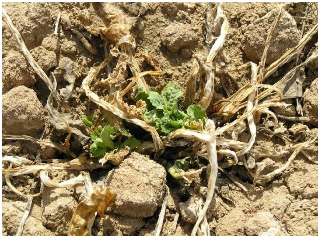
Figure 5. The start of the growth of the terminal bud occurs after the winter cold is over.

longer the acclimation period and the more stable the temperature fluctuations, the better the hardening process and the greater the plant's cold resistance. Research suggests that oilseed rape seedlings require at least seven days of exposure to near-zero temperatures to develop cold hardiness. Well-established winter oilseed rape varieties that have undergone hardening can endure short-term temperatures as low as -15^{\circ}\text{C} to -25^{\circ}\text{C} . If there is green tissue present in the central point of the plant after the winter cold is over, the plant will resume growth as the temperature and day length increase (Fig. 5). In case some plants have died due to winter cold, the branching ability of oilseed rape can largely compensate for the reduced plant density (Zhang et al., 2012).