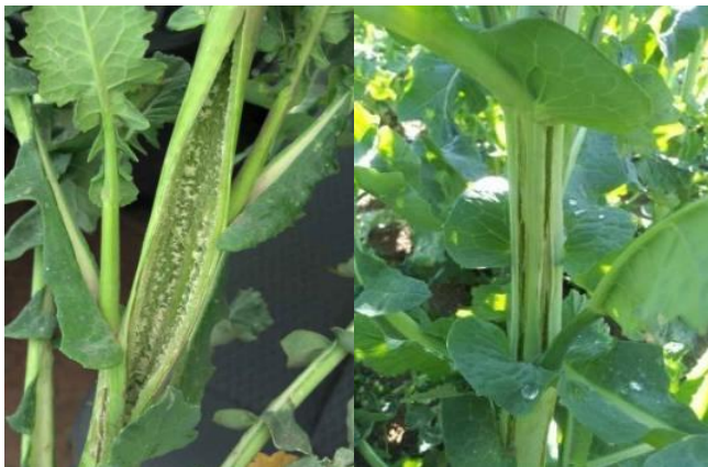
Figure 7. Cracking of oilseed rape stems caused by severe frost (freezing) during the bolting phase.

A snow cover on the ground creates an insulating layer against cold, which can reduce damage to the plant's crown area and increase cold tolerance. Snow is an excellent insulator for protecting oilseed rape plants from severe temperature drops (Raboanatahiry et al., 2021). Oxygen and carbon dioxide have good permeability through the snow cover; the permeability of ice is normally subjected to carbon dioxide, which is up to a million times lower than that of snow. Oilseed rape plants under snow cover can sometimes tolerate temperature drops as low as -30^{\circ}\text{C} . In oilseed rape, the sap in the crown does not freeze until -13^{\circ}\text{C} ; however, when the soil freezes due to extreme cold, this ice efficiently conducts the outside air temperature to the surrounding environment and beneath the soil. The development of ice in the soil disrupts root respiration, and in the anaerobic respiration pathway, ethanol and malates are produced in the roots, causing significant harm to the plant (Flakelar et al., 2018).