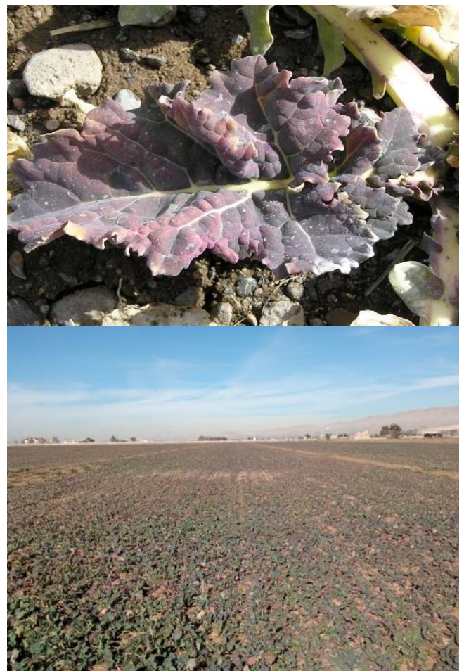
Figure 2. Effect of cold on oilseed rape leaves: purpling and thickening in the field.

regulates the duration from germination to the end of the vegetative phase and from stem elongation to mid-flowering (Gabrielle et al., 1998). The optimal temperature for oilseed rape leaf growth is 13^{\circ}\text{C} to 22^{\circ}\text{C} . At higher temperatures, growth accelerates, shortening the leaf growth period. Cold temperatures during the early growth stages do not necessarily reduce seed yield (except in cases of severe frost), but they do slow down plant growth and development. During the rosette stage, when winter oilseed rape is exposed to subzero temperatures, leaf purpling occurs, affecting both the upper and lower leaf surfaces. This purpling may spread across the entire leaf surface and is a result of anthocyanin accumulation, a response to cold stress (Rathke et al., 2006). Anthocyanins act as protective pigments, accumulating in the stems and leaves under cold conditions to shield the plant from high light intensity in late autumn and winter (Fig. 2).