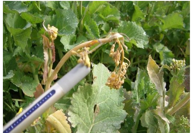
Figure 8. Occurrence of cold damage and stem bending at the beginning of the flowering stage of oilseed rape.

stage of oilseed rape may significantly reduce yield (Bañuelos et al., 2013). Spring frost during flowering often causes leaf discoloration and whitening, and stem and lateral branch bending may also be observed (Fig. 8). Once the frost subsides, the plants return to normal and continue their regular growth.