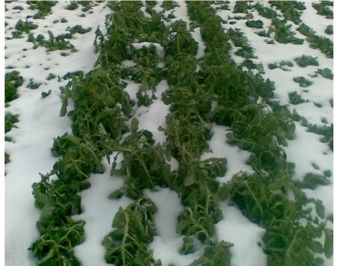
Figure 6. Bolting of oilseed rape at the beginning of winter and frost damage resulting from it.

Spring varieties, in which bolting usually occurs in late winter, are also entirely at risk. If the temperature drops below zero during the bolting stage of oilseed rape, the water inside the stem (extracellular water) freezes due to severe cold, and when the cold dissipates, it begins to thaw. This causes the stems to crack and split. However, oilseed rape can continue its natural growth. If the cracking is severe, the likelihood of plant lodging increases. Furthermore, the cracks in the stem may serve as entry points for pathogenic fungi, which can cause stem rot (Fig. 7). Oilseed rape can tolerate cold during vegetative growth, but this adaptation is lost when it is exposed to high temperatures again (Miura and Furumoto, 2013).